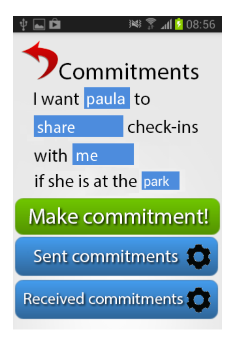
Figure 3: Commitment (1) as it appears on the app (translated from Dutch).