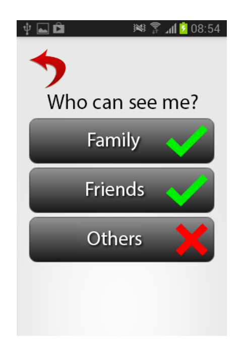
Figure 1: Selecting which lists of users can see your check-ins (translated from Dutch).