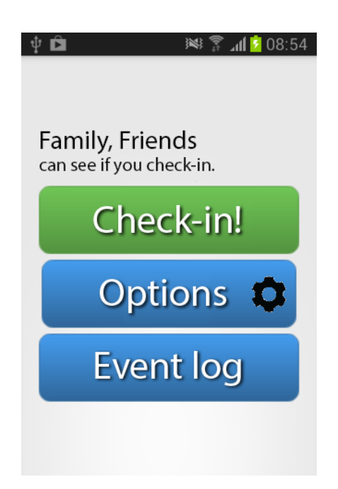
Figure 2: The main screen in the app, showing the check-in button (translated from Dutch).