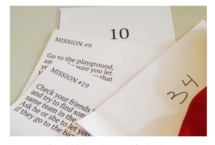
Figure 4: Mission cards (translated from Dutch).

Examples of the missions can be found in Appendix A, translated to English from Dutch, the original language.